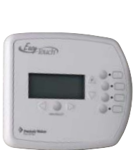
Indoor Control Panel