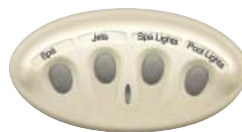
iS4 Spa-side Remote