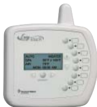
EasyTouch Wireless Controller