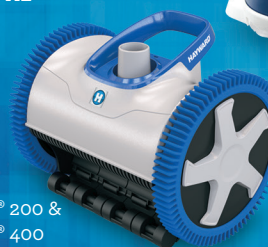
AquaNaut® 200 & AquaNaut® 400