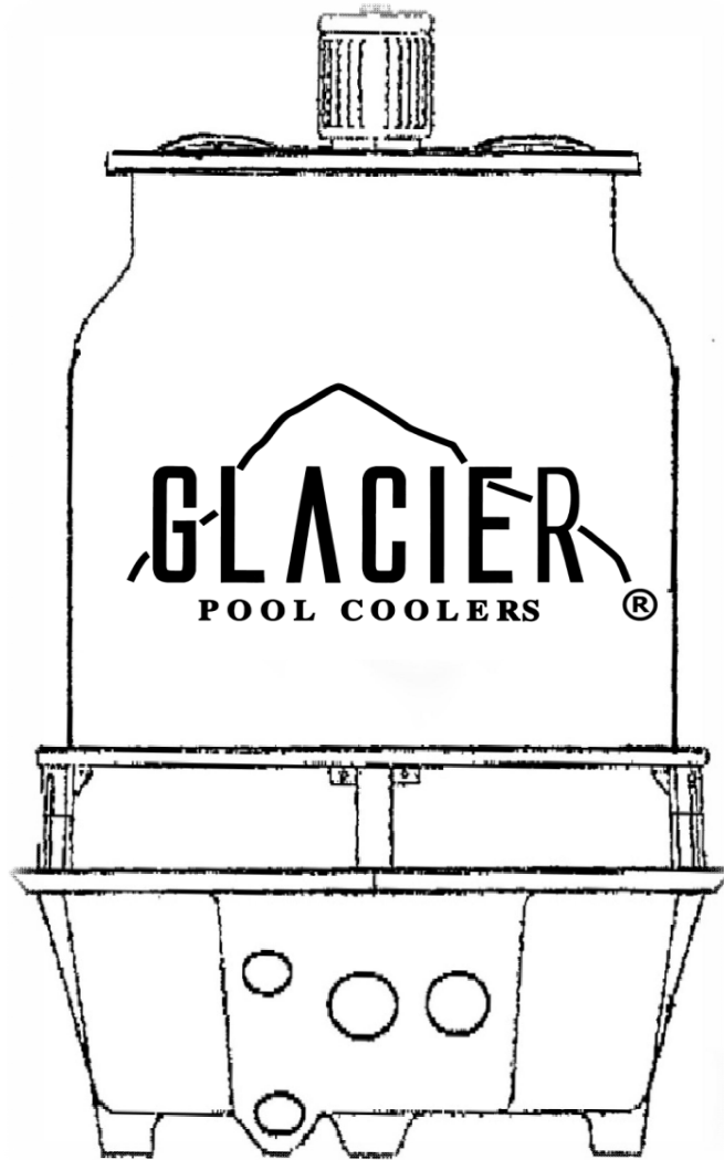
GPC 23-280 SERIES