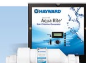
Chlorine dispensing for sanitizer control including electronic chlorine (salt) generator