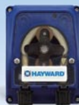
Chemical Feed Pump (2 pumps included as standard with HCC 2000 Complete Package)