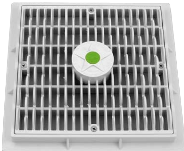
Model # WAV9xxx

NEW especially designed and engineered for ALL 1.0 and 1.5 fps states - great for gravity drain systems as well as direct suction