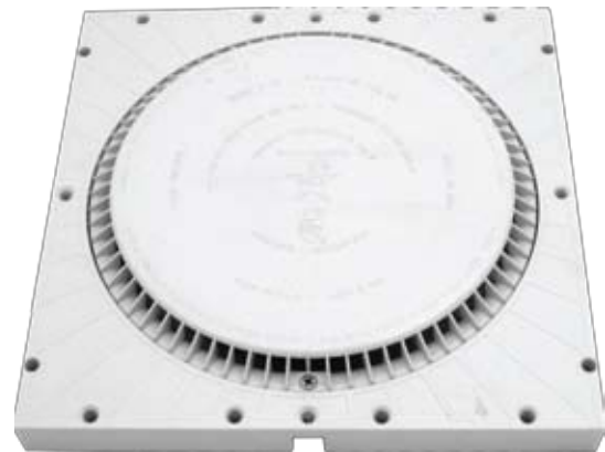
Model # RFS12xxx

*Fits: Hayward, Waterway, American (Pentair #2), PacFab