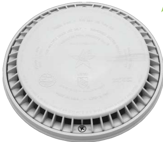
Model # 8AVxxx