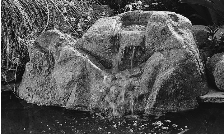
Part # 4100