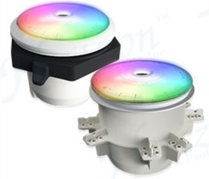
EVENFLOW 4FT WATERBLADE With Color LED Light Rear Entry