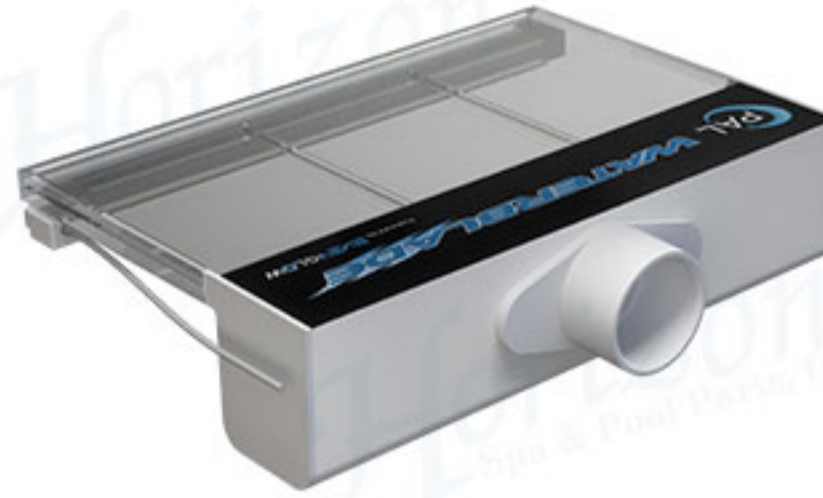
EVENFLOW 3FT WATERBLADE With Color LED Light Rear Entry