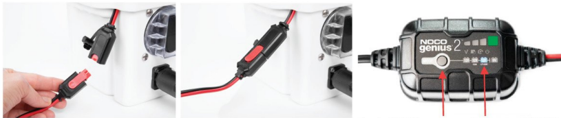
Use the MODE button to set the charger to LITHIUM

For more information about your Power-Sonic® battery, click here .