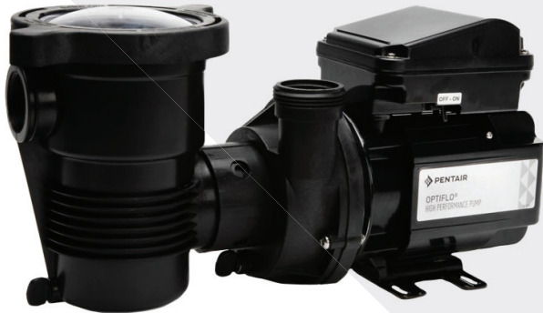
OptiFlo Aboveground Pool Pump

Note: The 3/4 HP OptiFlo, 1.5 HP OptiFlo and all Dynamo pumps represented here are non-compliant products included strictly for comparison. The new 1.0 THP OptiFlo represents the only series of pumps available for order.