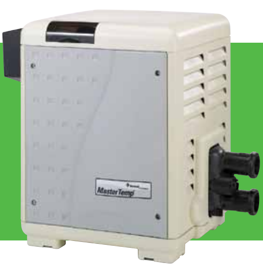
MasterTemp® High Performance Heaters

MasterTemp® high performance heaters offer best-in-class energy efficiency. Plus, they are certified for low NOx emissions, making them eco-friendly favorites.