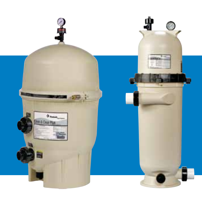
Clean & Clear® Plus Cartridge Filters

• Chemical-resistant, fiberglass-reinforced polypropylene tank provides exceptional strength.