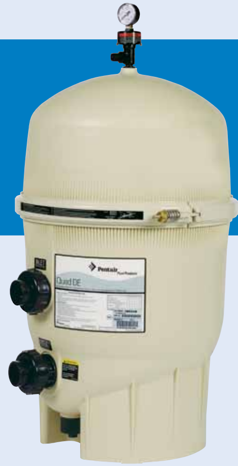
Quad D.E.® Filter

Chemical-resistant, fiberglass-reinforced polypropylene tank provides exceptional strength.