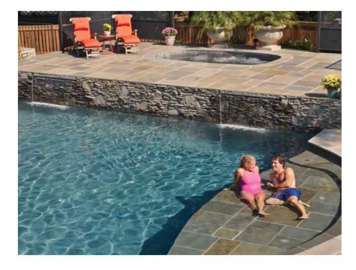
When it comes to moving more water faster and serving multiple features, you can count on Challenger.