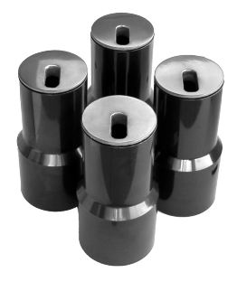
DECK JETS PART# JDJ2004