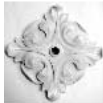
#2220 Star Med.