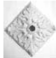
#2230 Oak Leaf