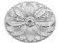
#2190 Sunflower Sm.