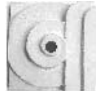
#2240 Art Deco