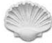
#2430 Shell Hand Hold