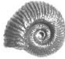
#2420 Fossil Nautilus