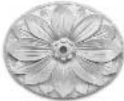
#2200 Sunflower Lg.