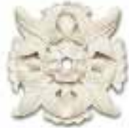
#2170 4 Point