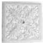
#2270 Square Fern