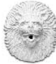
#2060 Baroque Lg.