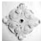
#2210 Star Sm.