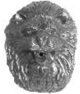
#2410 Baroque XL