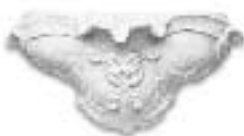
#2300 Fleur de lis