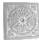
#2280 Square Dahlia