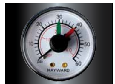
Pressure and Cleaning Gauge