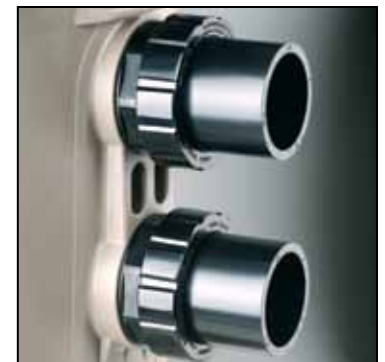
CPVC Union Connections