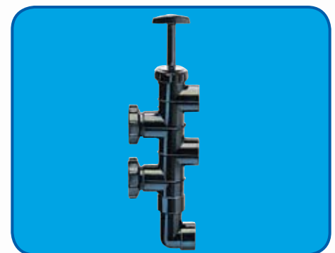
2-Position Slide Valve