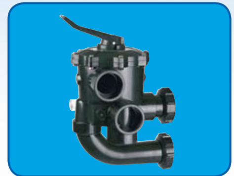
4- or 6-Position Multiport Valve