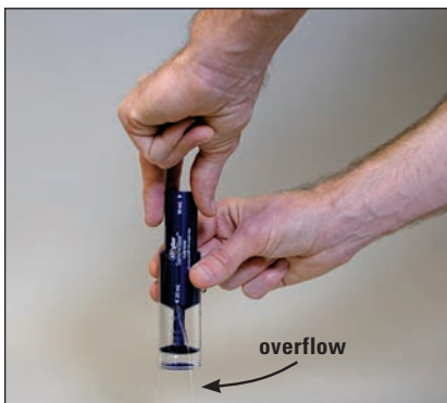
4. ...all excess water will be displaced.