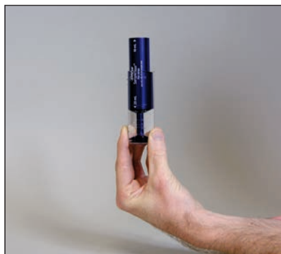
5. Tool should touch bottom.