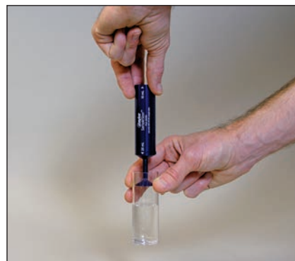
6. Carefully remove SampleSizer to avoid dragging out remaining water. Voilà!