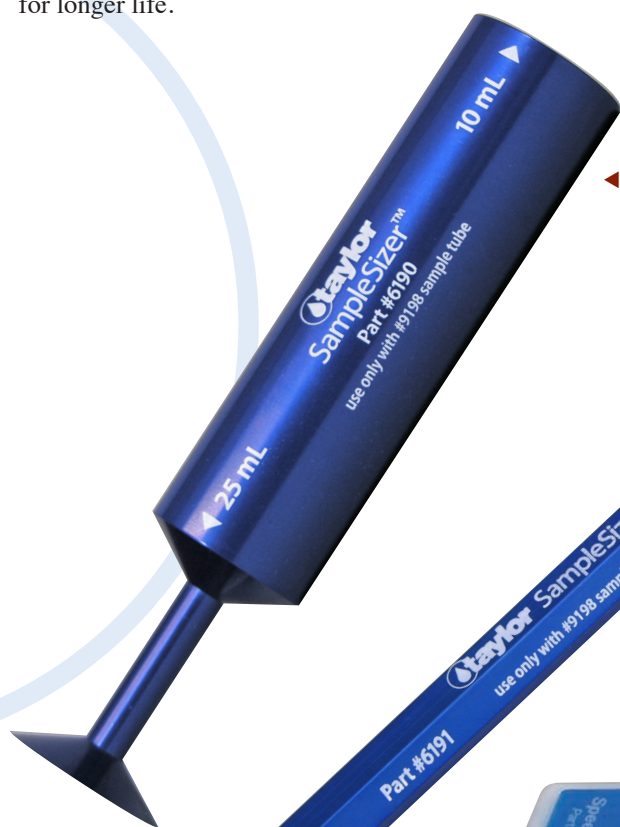
◀ SampleSizer #6190 1" w x 4 3 / 4 " h Available singly or in a multipack of 12