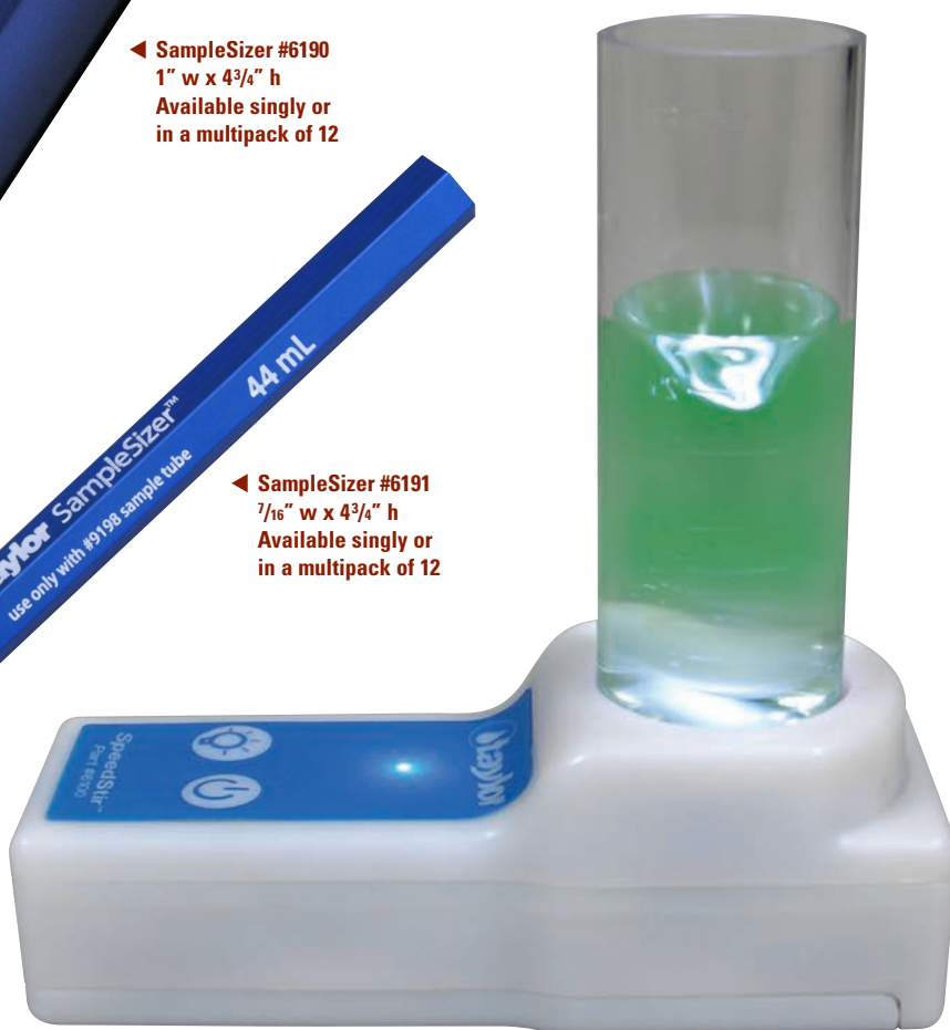
SpeedStir ▶ 4 5 / 8 " l x 1 3 / 4 " w x 1 5 / 8 " h (Shown with #9198 sample tube supplied in #9265 Start-up Pack)