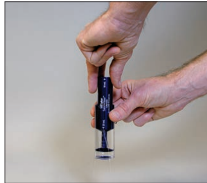
3. Slowly lower the tool into the sample...