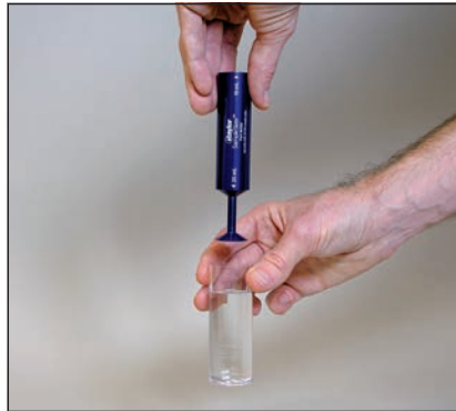
2. Orient SampleSizer for desired test volume: an arrow indicates the skinny end goes first for a 25 mL sample.