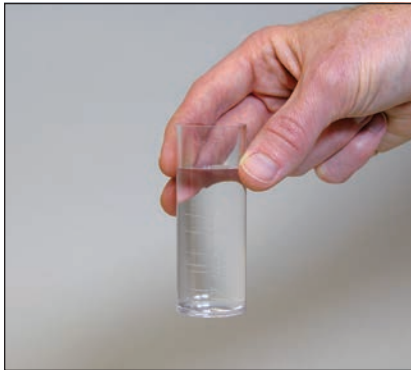
1. Rinse and fill #9198 sample tube with water to be tested in excess of desired volume.