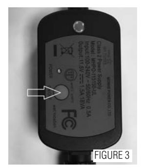
NLMC Man.Ver 1.0_7_2019